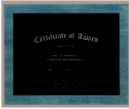
11 X 14 Diploma Plaques for 8 1/2 x 11 are Now only $29.95 each.