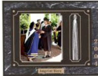
14" x 17" Tassel Picture Plaques for 8 x 10 are now only $44.95 ea. With brass plate for engraving & Numerals